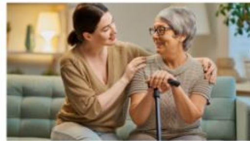
CEAL 21 (5 Hours) >