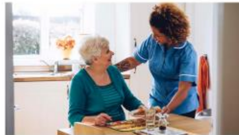
CEAL 12 (5 Hours) >