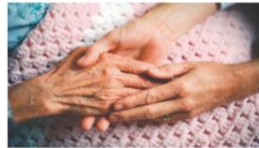
CEAL 42 (5 Hours) >